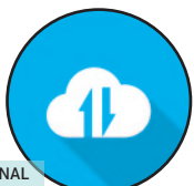
External Comms Package