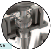
Motor-Driven Sample Carousel