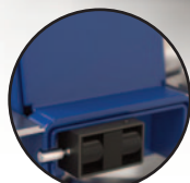
Solenoid-Based Locking Lid