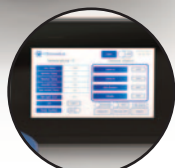
Large, Intuitive Touch Screen