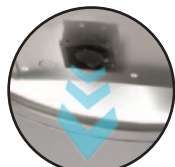
Defogging Fan & LED Light