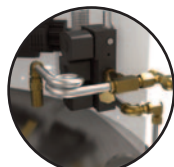
Leak-Free Manifold Plumbing