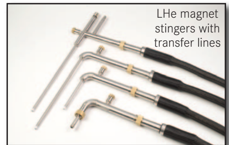
LHe magnet stingers with transfer lines