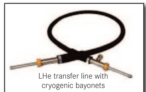
LHe transfer line with cryogenic bayonets