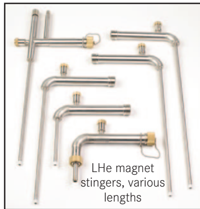
LHe magnet stingers, various lengths