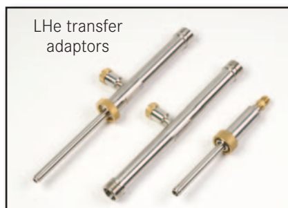
LHe transfer adaptors