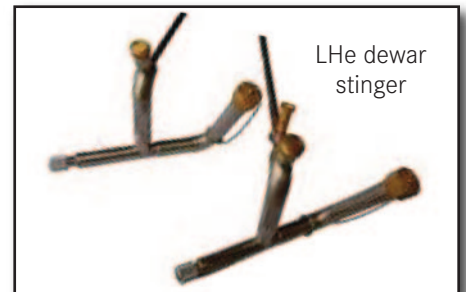
LHe dewar stinger